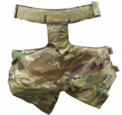
Blast Pelvic Protector (BPP)