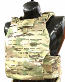
Modular Scalable Vest (MSV)