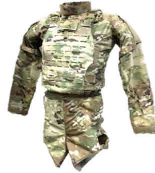
Torso Extremity Protection (TEP)