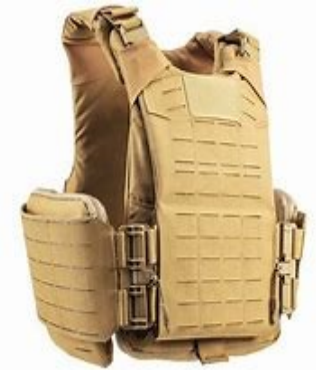
Plate Carrier (PC) Generation III