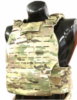
Modular Scalable Vest (MSV)