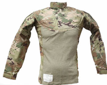
Female Ballistic Combat Shirt (FBCS)